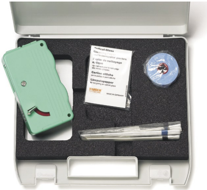
OCK-10 Optical Connector Cleaning Kit (accessory)