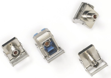
Optical adapters (BN 2150) for laser source output