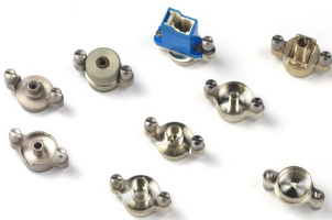
Optical adapters (BN 2014) for power meter output